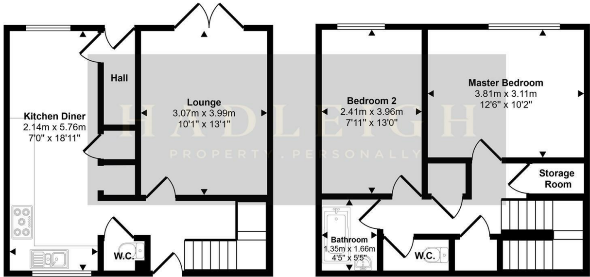
Ground Floor Approx 37 sq m / 397 sq ft

Approx Gross Internal Area 74 sq m / 798 sq ft